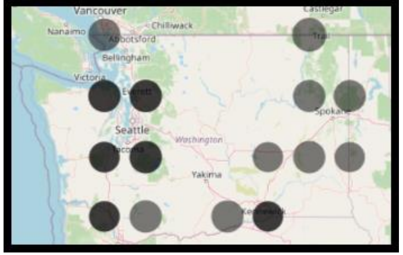
SURVEY RESPONDENT GEODATA LOCATIONS IN WASHINGTON