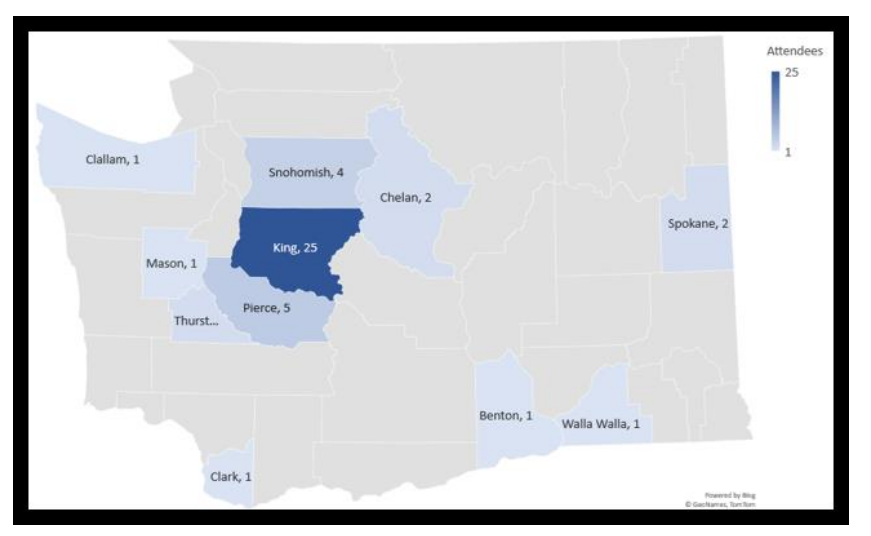
Listening session participants by county.