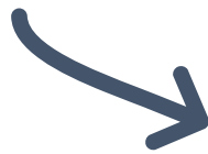
Table for Tax Year 2023